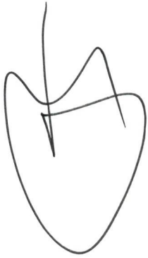
HON. CRISOSTOMO C. GARBO

Chairperson, Mayor of the LGU of Mabalacat City